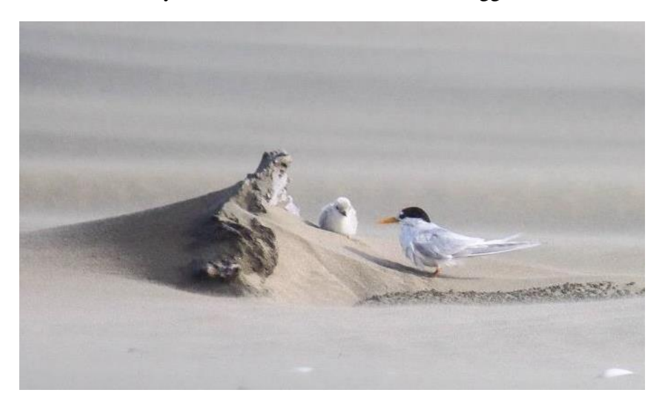
The Papakanui chick with father (B) -RM, known as Bertram, the oldest male fairy tern.

Another nest at Papakanui was washed away and although the egg was rescued and taken to the Zoo, it failed to develop.